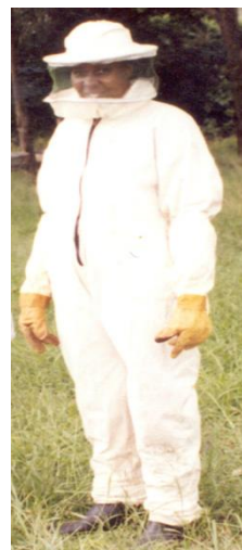
Protective kit