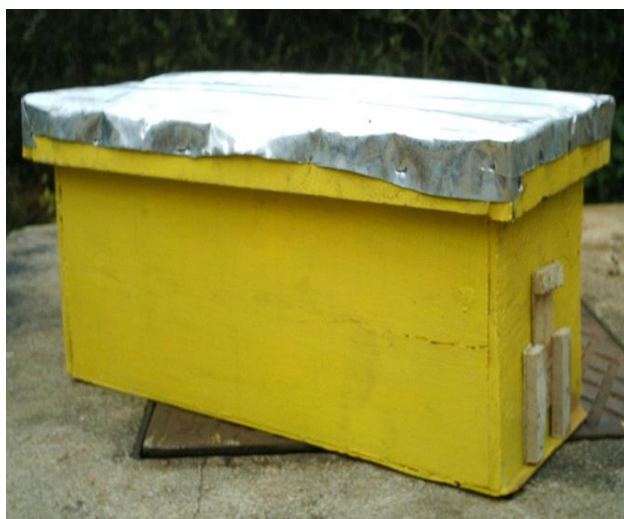
Langstroth Catcher box