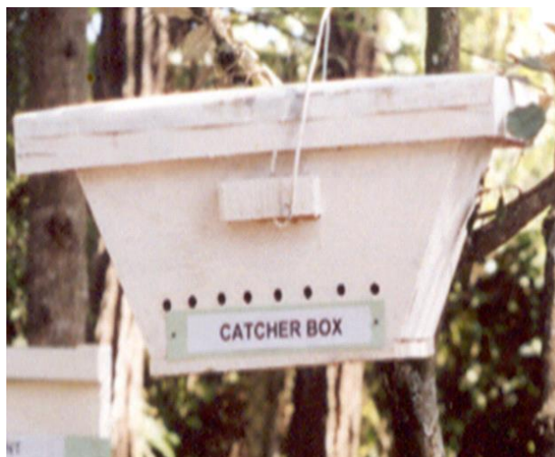
KTBH Catcher Box